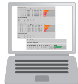
USB Connection Download CSV & HTML Files